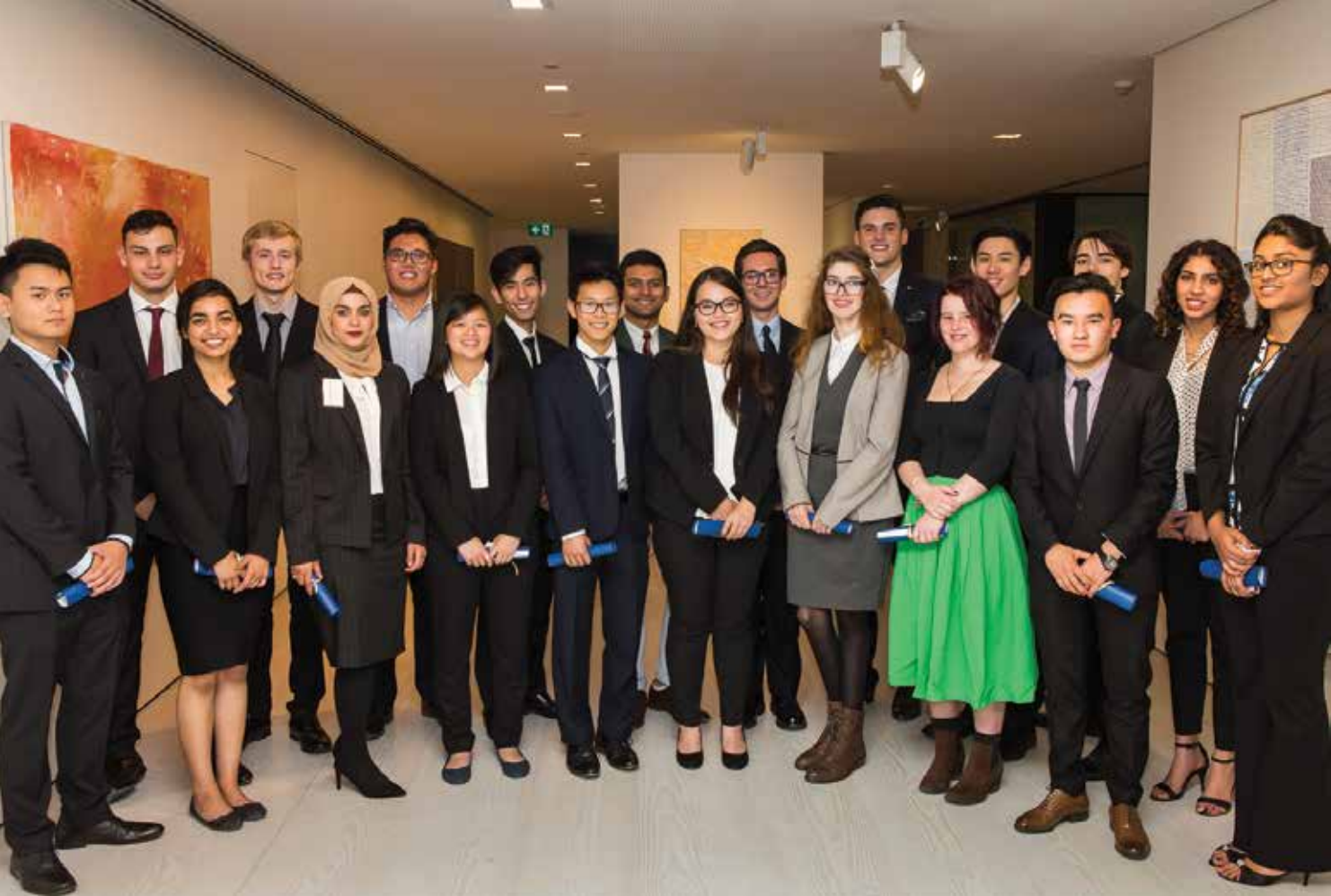
2017 Cadets at the Cadetship Induction & Graduation Event at Allens Linklaters