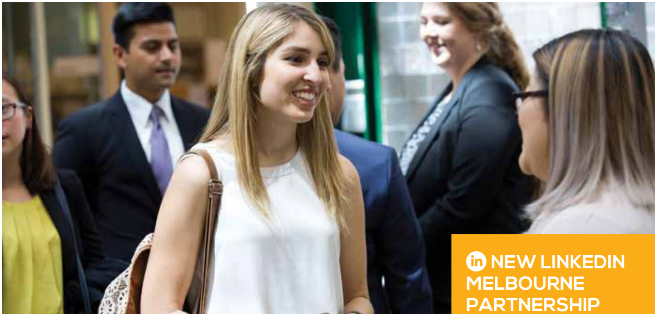
Doxa program participants