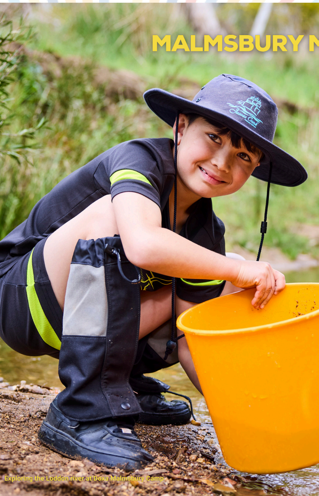
Exploring the Loddon river at Doxa Malmsbury Camp

Our ambitious programme of upgrades at our Malmsbury Camp is progressing at a feverish pace. Over the last two months, we have installed a new filtration system to improve water quality and upgraded electricity boards to ensure an adequately dimensioned and reliable power supply. The most noticeable change for our campers is that they now have access to a good WiFi service after the installation of current generation equipment and the creation of better satellite links.