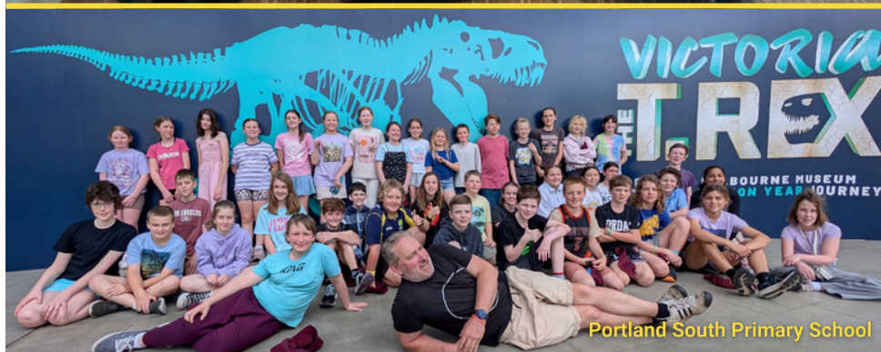
Portland South Primary School