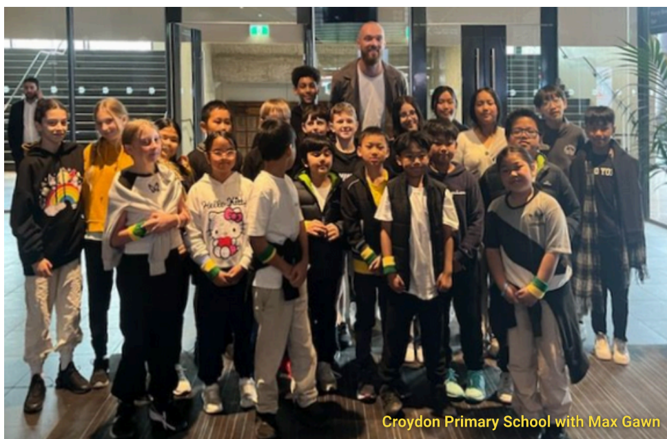
Croydon Primary School with Max Gawn

Don't miss the Doxa Youth Foundation billboards at the Geelong Station. They celebrate the partnership between our organisation and V/Line. V/line is one of our oldest and most valued partners. When the Malmsbury Camp opened over fifty years ago, V/Line (then the State Government Department of Railway), began providing free rail travel for schools to and from the camp and today, still does this for both our city and Malmsbury camps. V/line also donates free tickets to special exhibitions at the Melbourne Museum and the Art Gallery of Victoria for our city campers. See picture of Portland Primary School at the "Victoria the T-Rex" exhibition below. It has also provided work placements for our cadets.